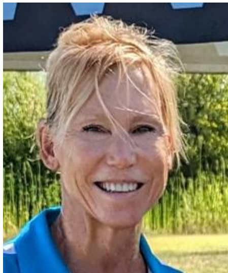
cropped photo for board application.jpg