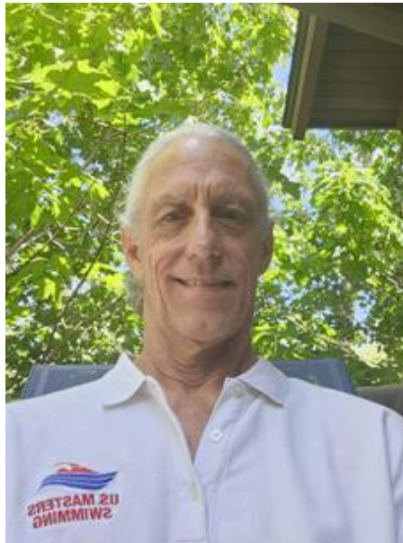
Rob Heath Photo.jpg